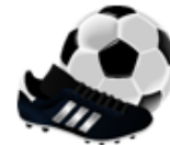
A sport—Which one?