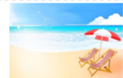
The Beach, Swimming